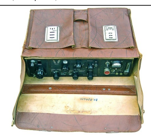
The SEM-78 was packed and carried in an inconspicuously looking leather briefcase. Accessories were stowed in the two compartments on the side of the case.

In WftW Volume 4 the unknown 'West German 50-60s Suitcase Set' in the 'Germany after 1945' chapter, was assumed to be a follow-up or replacement of the Telefunken Type 41\,\mbox{-} also referred to as ESK632 and 'Amateurgerät' (Amateur set) - . This hitherto unknown suitcase set was positively identified as SEM-78, thought to be developed and produced by Telefunken Hannover Fernseh und Rundfunk GmbH (consumer electronics) without the knowledge of Telefunken Ulm which was responsible for commercial and military communication equipment. Later information, however, pointed to the belief that it might have been made by Lorenz, but confirmation is still required. The SEM-78 was comprised of three separate units fitted in a mounting frame: receiver (left), transmitter (centre) and power supply unit (right). A surviving set shown on this page was found in Slovenia, packed in it's original leather brief case complete with a Yugoslav manual. It was possible that one or more captured SEM-78's were put into service by the Yugoslav State Security (UDBA). A probably earlier developed set with a similar appearance was the 'Unknown Telefunken'. (See Chapter 135).